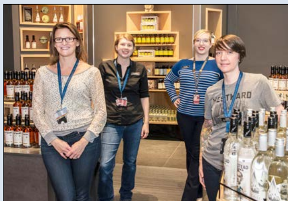
House Spirits Distillery (Concourse C)