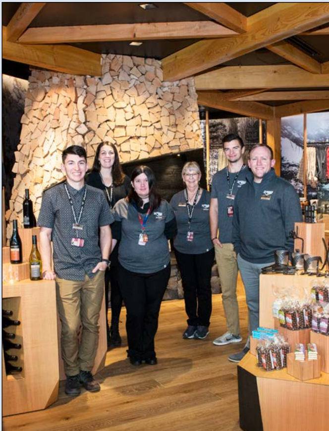
Timberline Lodge (Concourse D)

PDX has much to be thankful for this holiday season! November saw the opening of new concessions and the remodeling of existing locations, kicking off a transformation that will continue long into 2017. In this issue of PDXaminer, we give thanks for: The only airport distillery tasting room in the world, House Spirits; Pacific Northwest-focused apparel and souvenirs at Timberline; acai bowls and smoothies at Moberi; products from the state's finest artisans at Made In Oregon; and coffee products nurtured from seed to cup at Portland Roasting. Stay tuned for more openings in the next issue!