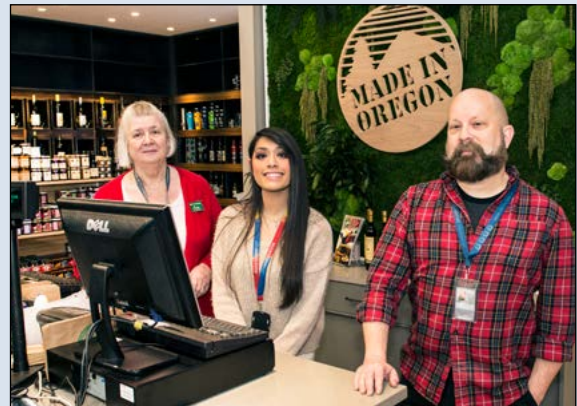
Made in Oregon (Concourse C)