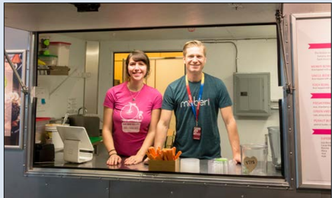
Moberi (Oregon Market)