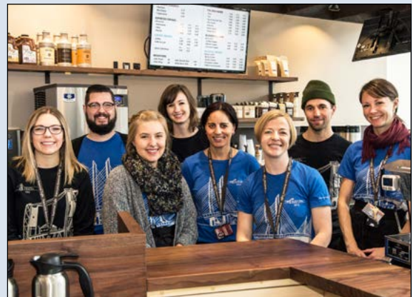
Portland Roasting (North Ticket Lobby)