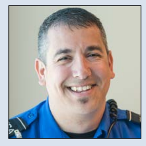
"I had a guy take off his clothes down to his boxers. He just wanted to make sure we knew that there wasn't anything on him. It's crazy how often people want to take off their clothes!"