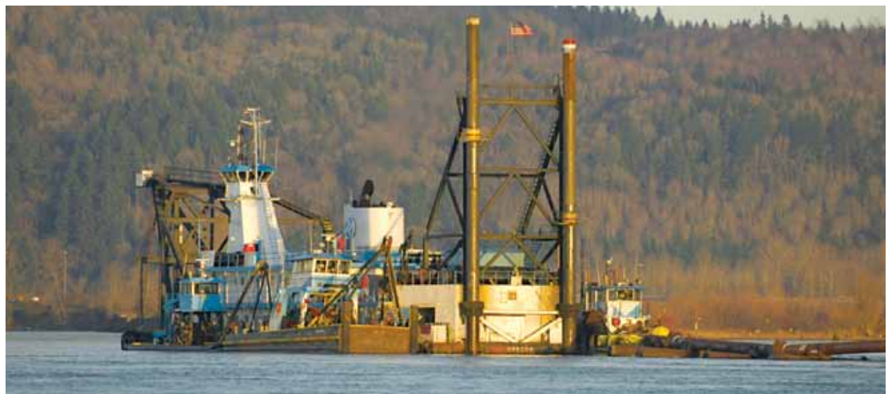
Upgrades to the Dredge Oregon, funded by ConnectOregon III, will make the vessel, shown here working on the Columbia River, more fuel-efficient.

The U.S. Maritime Administration chose projects and initiatives from 35 applications submitted by ports and local transportation agencies. The Port of Portland, the Pacific Northwest Waterways Association, and other stakeholders on the river system had advocated for the designation.