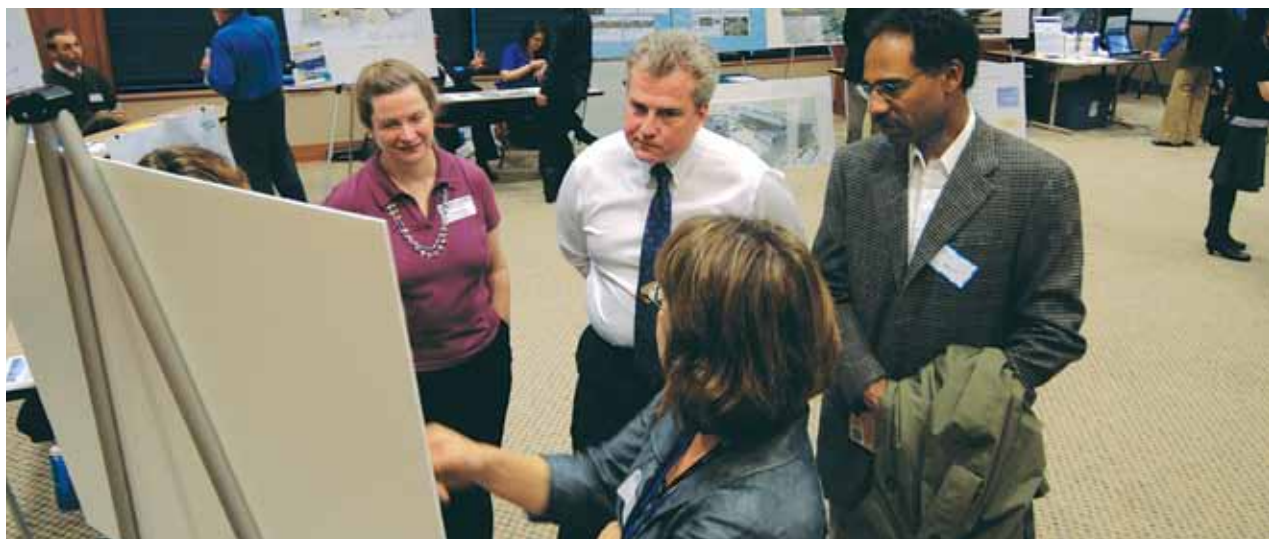
Port staff meet with members of the public at an Airport Futures open house.