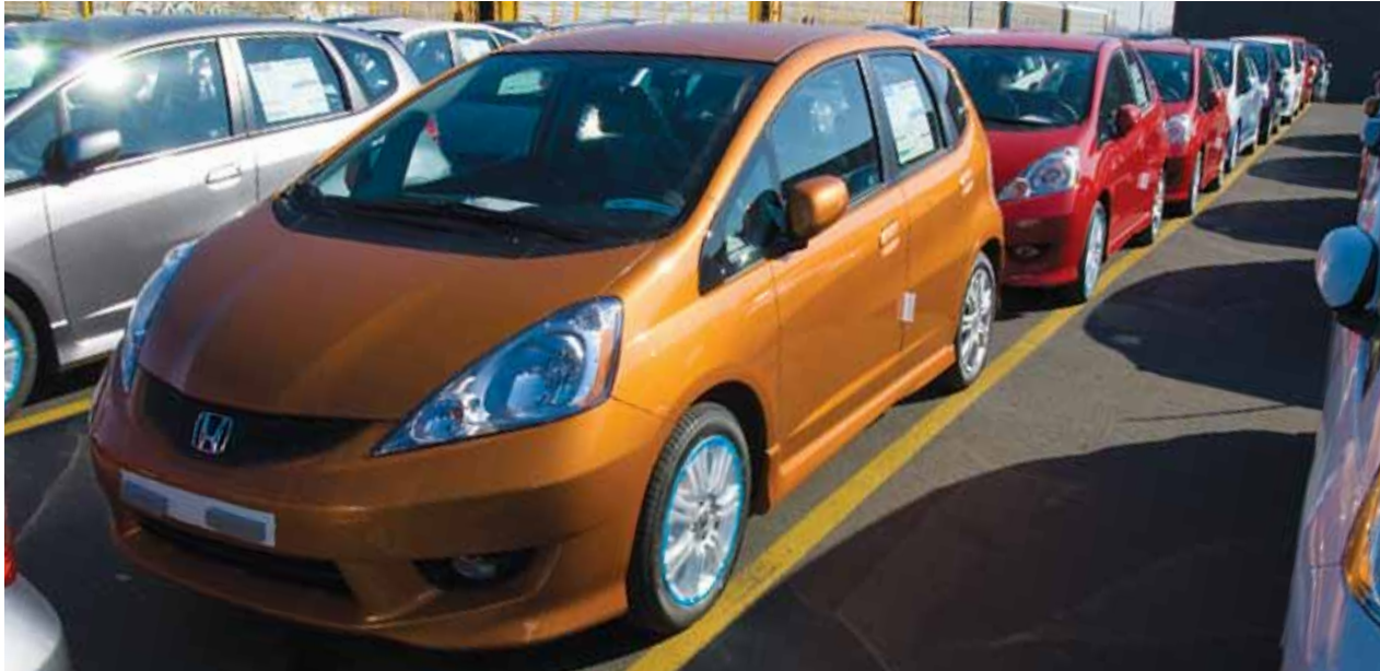
The American Honda facility includes 62 acres with rail service from BNSF Railway.

Auto Warehousing is the largest full service auto processor in North America. The Tacoma, Wash.-based company has 23 locations in the U.S. and Canada, including two facilities at Terminal 6.