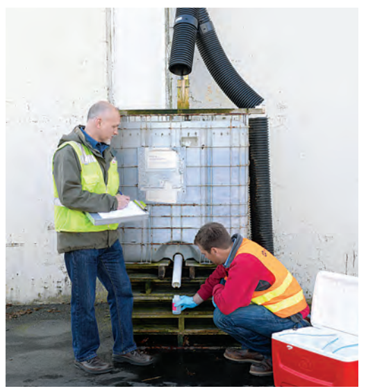
New Portable Media Filters treat stormwater runoff.

Two pilot Portable Media Filters, built by maintenance staff, have been installed at Portland International Airport to treat