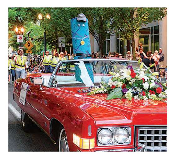
The PDX Carpet served as the Grand Marshal for the 2015 Starlight Parade, followed by PDX employees.

In April, pieces of both the outgoing iconic carpet and the incoming new airport