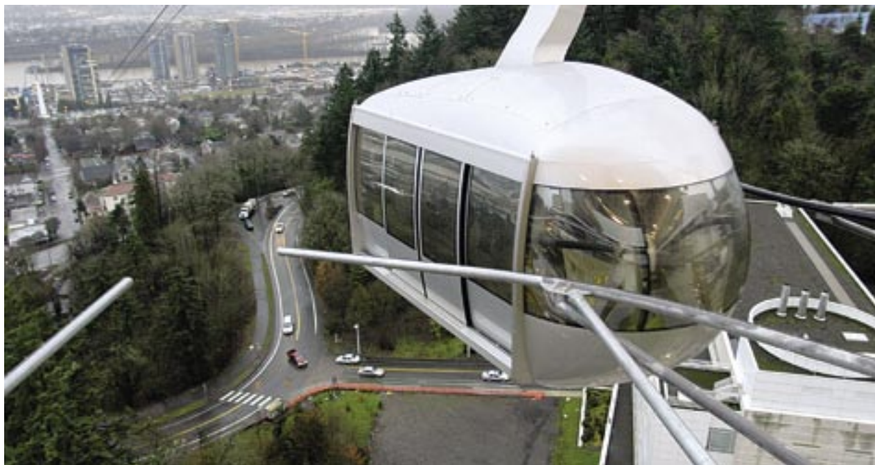
Each tram carries up to 78 people on the 4,000-foot, four-minute journey between the university and the new office buildings, condominiums and apartments at Portland's South Waterfront.

The two tram cars, manufactured by Gangloff Cabins in Bern, Switzerland, traveled by truck, barge and container ship to get to Portland.