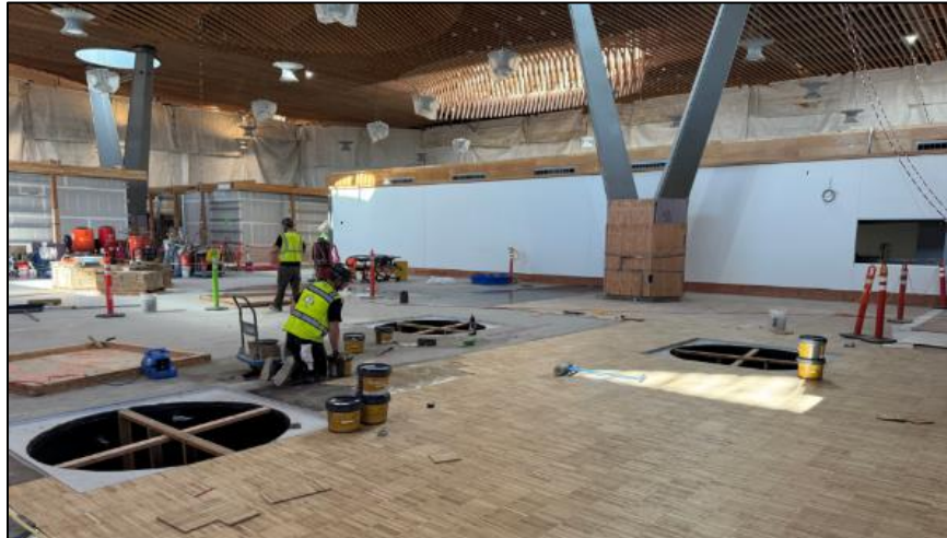
Oregon white oak flooring installation in progress during October 2025