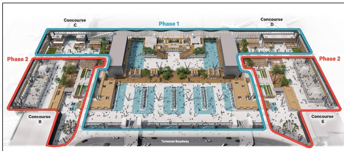
The remaining 30% of the PDX airport remodel (Phase 2), is scheduled to open in early 2026. (Port of Portland)

360 views: The glass curtainwall is nearly complete, which will ultimately enable 360 views of the outdoors at PDX.