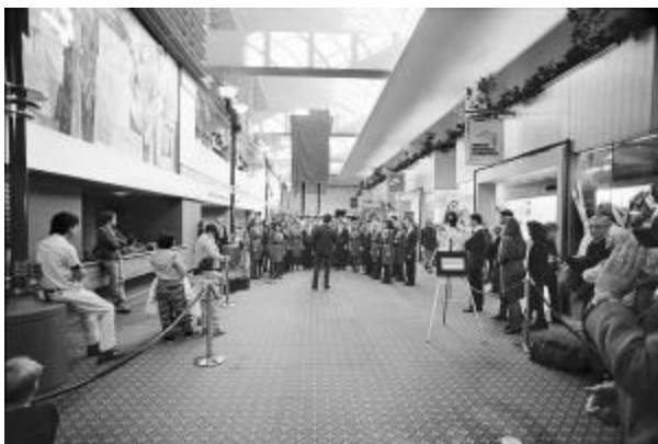
Opening Event 1988