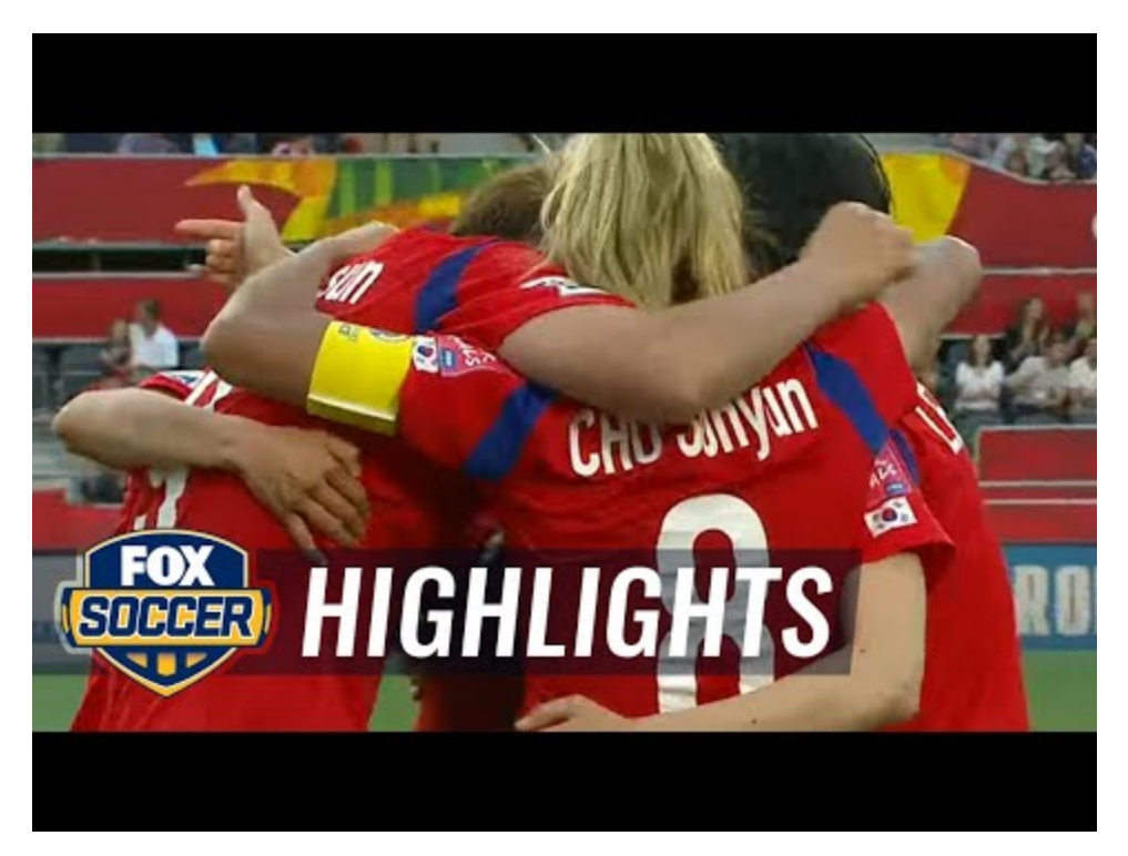
Watch Video At: https://youtu.be/YEACBloDbFo

Trade connections: Electronics and agriculture were the most significant industries contributing to the $1.7 billion in Oregon exports that went to Korea in 2018. While computers and electronics are still Oregon's largest export industry – accounting for one-third of Oregon's exports – they did see a 14% drop last year from 2017 levels. This impacted export numbers to countries like South Korea, although our agriculture exports to Korea grew.