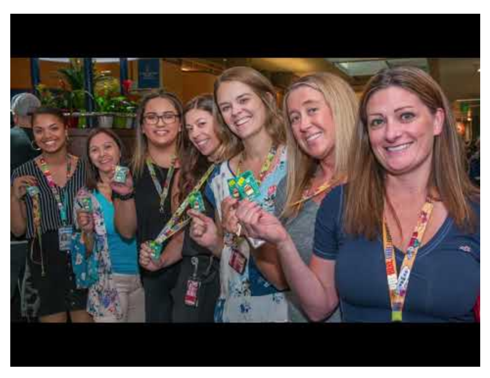
Watch Video At: https://youtu.be/5Xk6H_NNclw

At the Port, we care a lot about how we do our work. That includes how we show up for one another. We are 800 people who love this region and collectively want to make it better. This year, we volunteered together. We <u>promoted health and wellness</u>. We celebrated our various cultures and backgrounds. And we had tons of fun. Together.