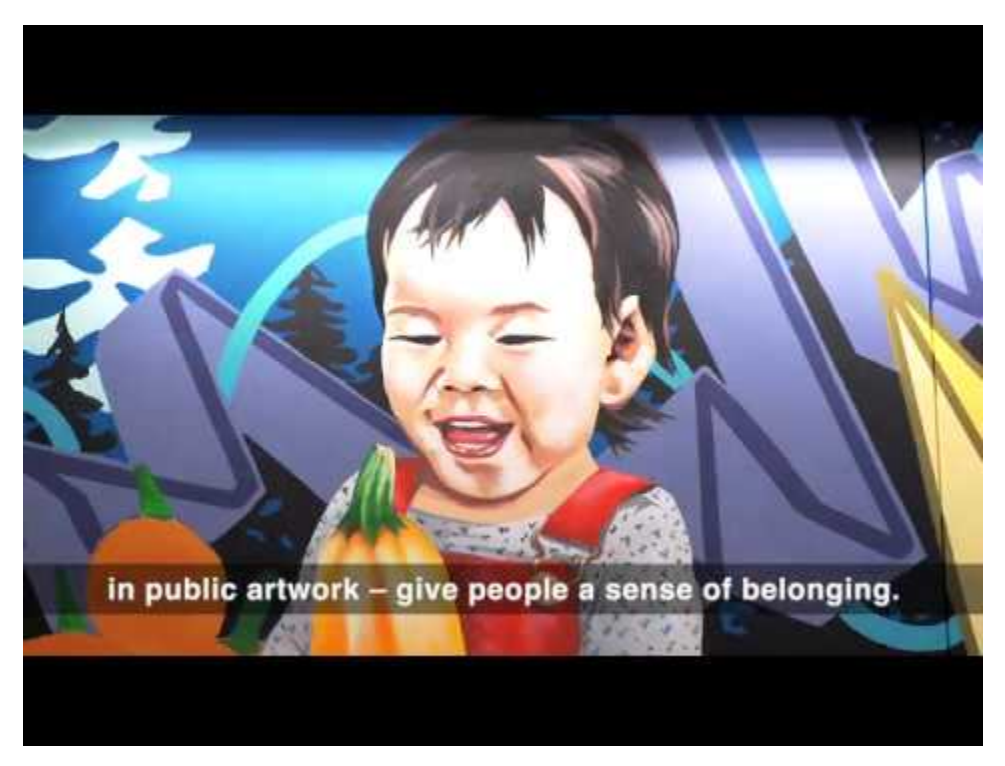
Watch Video At: https://youtu.be/X3gnE2hmtuo

If your plans don't bring you to PDX in the near future, we launched a website that highlights the places and people featured in the mural.