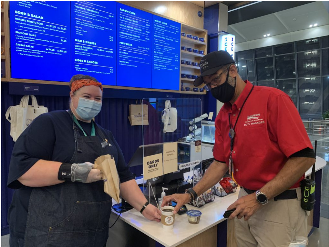
Tillamook Market is serving up Thornton Coffee, a family-owned coffee roaster based in Beaverton, Oregon.

Check out the full list of restaurants and shops that are currently open on our Travel Safe website (Note: their hours may vary right now). And we hope you enjoy a soothing cup of coffee on National Coffee Day.