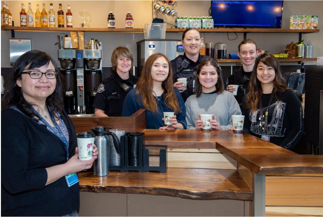
Portland Coffee Roasters staff during a Coffee With A Cop event in April 2019.