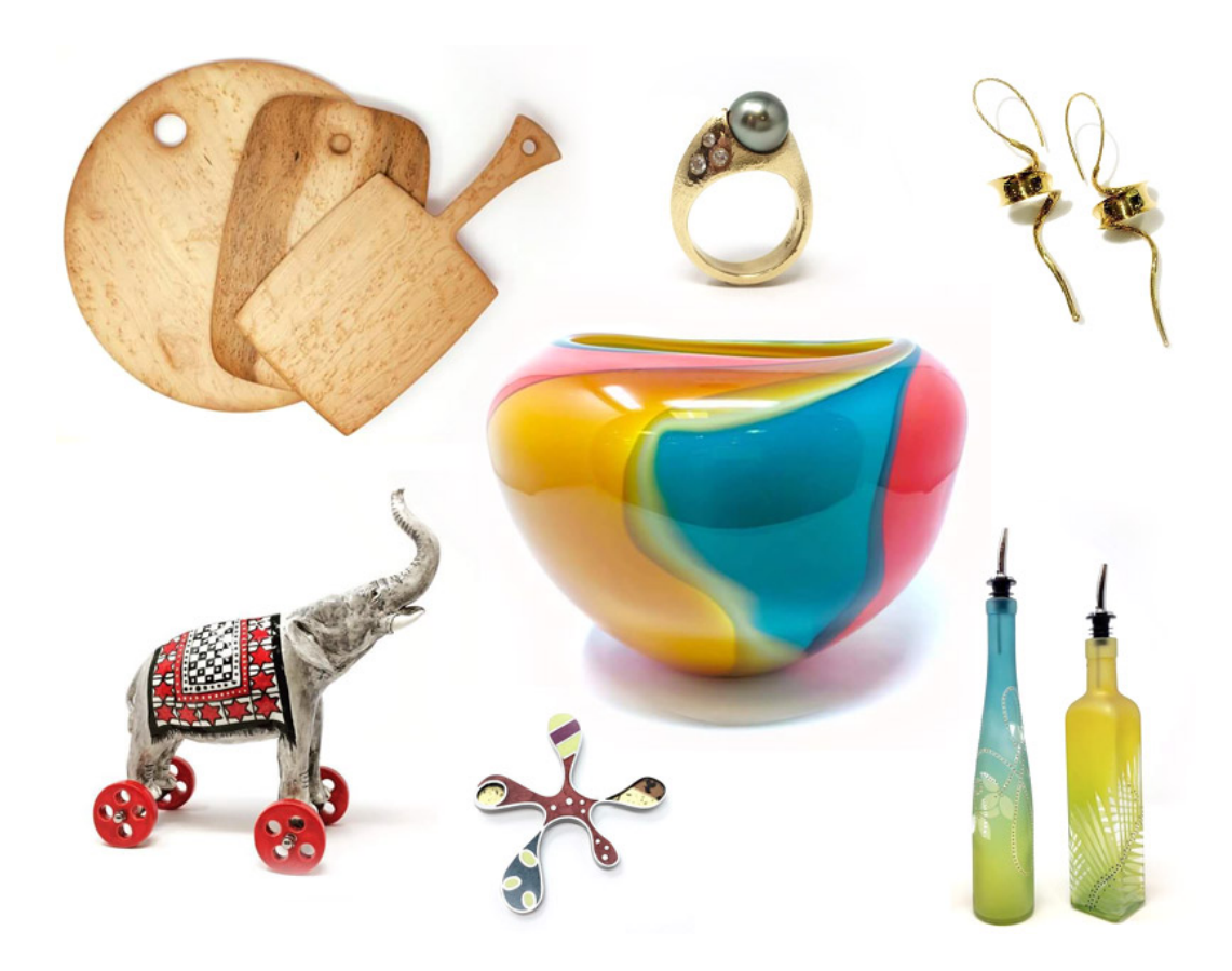
Did You Know? If you know someone who loves jewelry, check out Real Mother Goose , located at the PDX Airport.