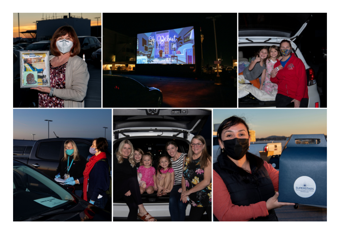
Want to see more? <u>Check out all the photos from the event</u> and <u>click through the slideshow</u> below to read the notes of appreciation for the Superstars from their managers and teammates.